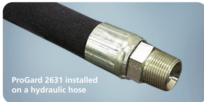
ProGard 2631 installed on a hydraulic hose

ProGard 2631 is used in a wide range of industries including hydraulics, mining, construction & agriculture.