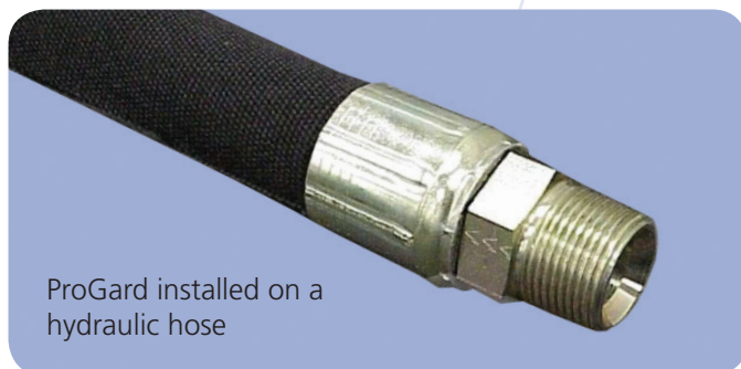
ProGard installed on a hydraulic hose

ProGard is used in a wide range of industries including hydraulics, mining, construction & agriculture.